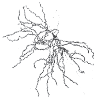
D. Spiny cell