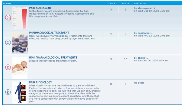
Figure 2. A snapshot the discussion forum highlighting the main discussion topics

5. Analysis: As the final step of our methodology we plan to perform two analysis: