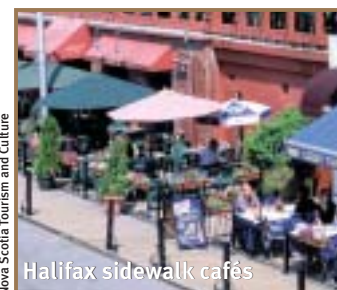
Nova Scotia Tourism and Culture

VIA Rail provides train service to the rest of Canada, with connections to US Amtrak. The station is located in the south end of Halifax. For more information call: 1.800.561.3952, or download schedules at: www.viarail.ca