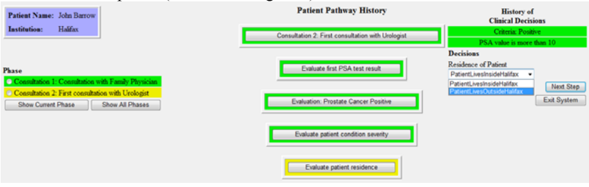
Figure 2. Screenshot of the prostate cancer management system. The left section shows consultations, the middle shows the patient's pathway and the right shows the decision made and decision options.

Interface, Execution, Property Abstraction and Ontology. Functionally, the system coordinates the care activities as per the location specific CP and stores the current treatment record for each patient. The system shows the location-specific care pathway for each patient as a sequence of states that are highlighted as completed states, active state and the next state. For each state, the execution engine performs the following: gathers and records patient data from the user/medical record, makes a decision, satisfies local constraints, provides related information/notification to the user. The CP execution is divided as per the four consultations and the user can either view just any specific consultation or the entire CP. The system has a web-based interface that is dynamically generated using the hasLabel property in the CP ontology and it shows (a) completed states in green, active states in yellow and by clicking on the active state the next states are displayed; (b) history of clinical decision made; and (c) values for the various decision points (as shown in figure 2).