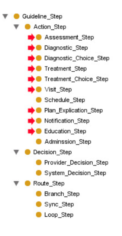
Figure 2. CPG steps as merging points are highlighted with an arrow

same time. Both CPG merge at the common step and then branch off to their respective paths when the common step is completed.